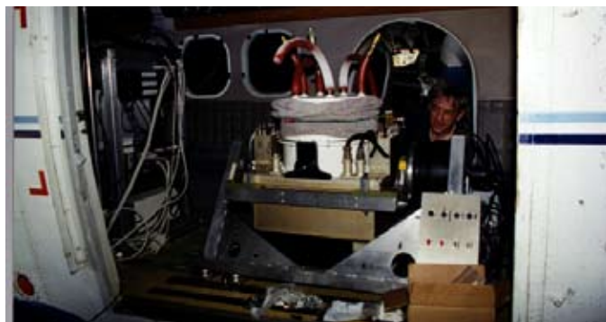
SEBASS shown mounted on its roll compensation stage in a Twin Otter aircraft. The sensor is cryogenically cooled with liquid Helium.

Laboratory Measurements - Aerospace experts can provide laboratory measurements such as UV-VNIR-SWIR-MWIR-LWIR spectral, X-ray diffraction and energy dispersive analysis of X-rays to assist in material characterization of samples taken from regions of interest. These laboratory measurements of samples establish ground truth and improve interpretation of remote sensing data.